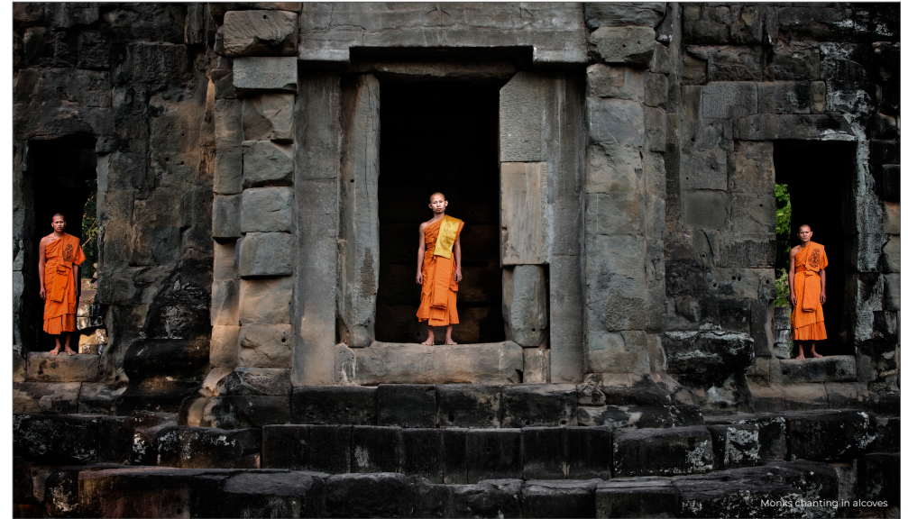
Monks chanting in alcoves