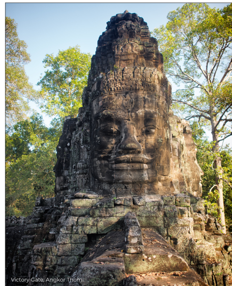
Victory Gate, Angkor Thom