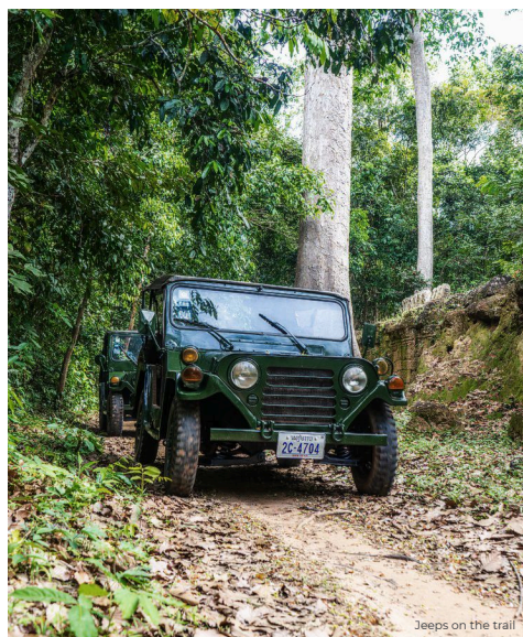
Jeeps on the trail