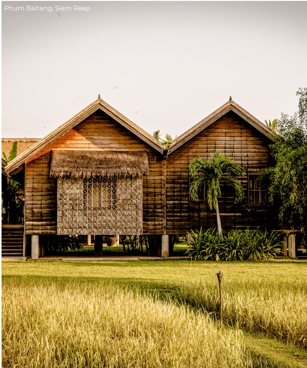
Phum Baitang, Siem Reap