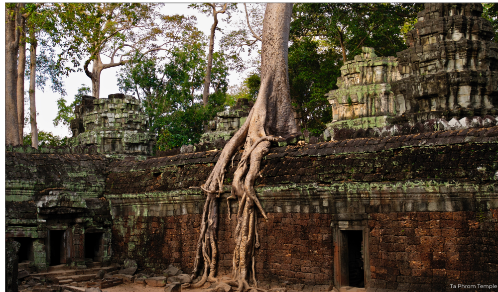
Ta Prohm Temple