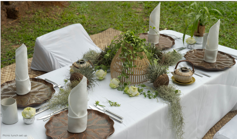
Picnic lunch set up