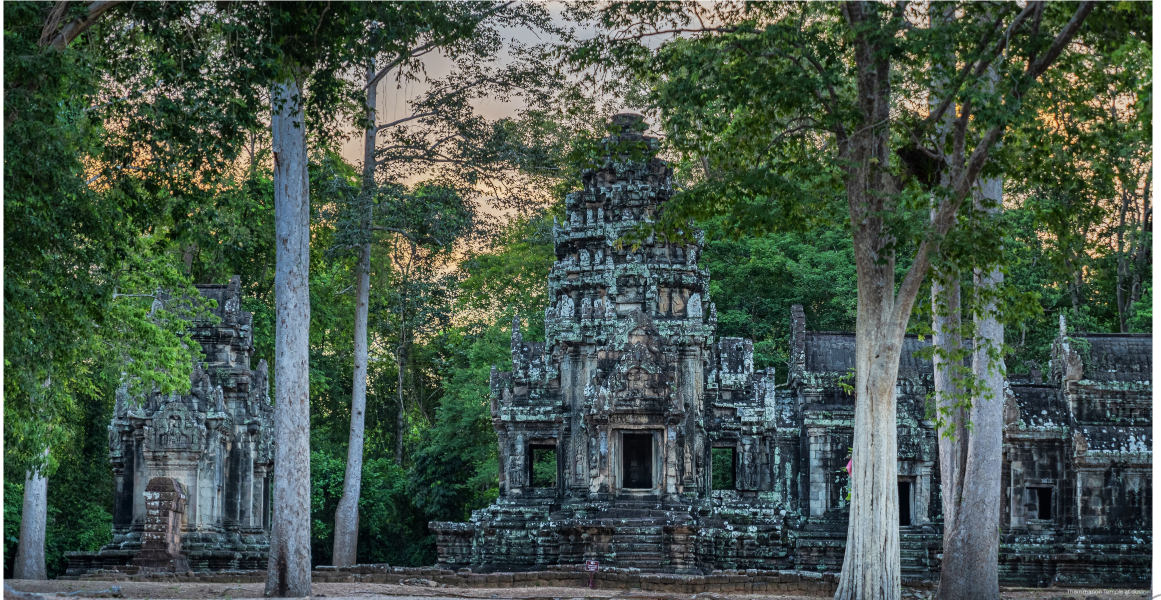
Thommanon Temple at dusk