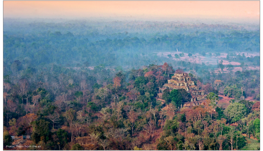
Prasat Thom from the air