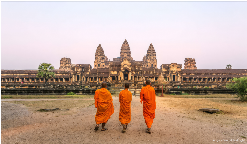
Angkor Wat at first light