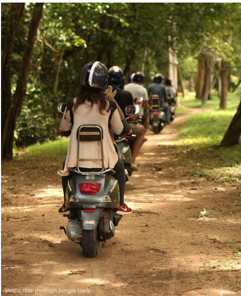
Vespa ride through jungle trails