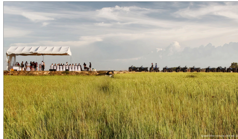
Quad Bikes convey and set up